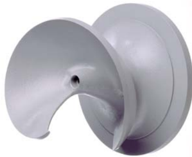
KSB 'D-Impeller' – single-vane, open type of impeller for high-fibre wastewater.

are designed to cut long fibrous objects (sticks, pieces of cloth, etc.) into smaller pieces. These impellers are optimized for specific types of solid debris and, as with the free-flow impellers, pumping efficiency may be compromised.