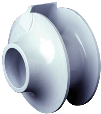
Closed or shrouded impeller.

tex and the relatively high pressure around the outer edge. Because of the stubby vanes and large clearances, this type of impeller is extremely resistant to blocking or clogging. Since there is only limited contact between the impellers and the pumped fluid, these work well with waste streams that contain significant amounts of sand or other abrasive materials. They also work well when there is gas in the fluid.