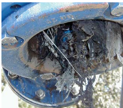
Solids and fibres can cause serious problems.

Operators are finding that these problems are getting more serious. Low-flow toilets and other water-efficient appliances are helping to reduce the per-capita water consumption, but with higher solids content in the remaining flow. (In Europe, per-capita water consumption has gone down 40% in the past 15 years.)