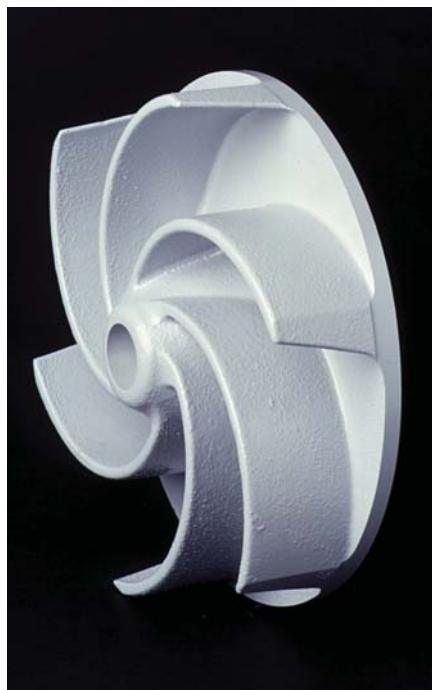
Free-flow or vortex type impeller.

Some pump manufacturers also offer so-called cutter impellers. These have special blades or shearing elements that